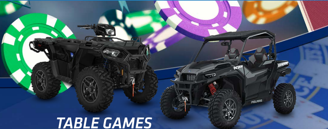
TABLE GAMES DOUBLE DEAL

CHANCE TO WIN UP TO $3,000 CASH OR ONE OF TWO OFF-ROAD VEHICLES!